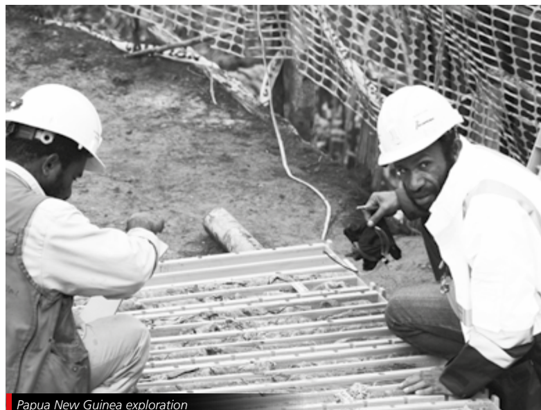
Papua New Guinea exploration

In line with Hidden Valley's current memorandum of agreement, Harmony continues to offer and encourage business development opportunities to landowners. Similar opportunities are expected to be available with the proposed development of the Wafi-Golpu project.