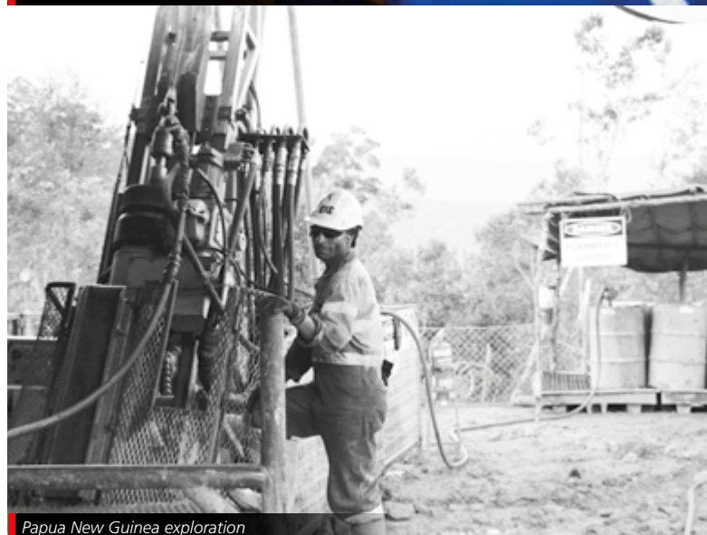
Papua New Guinea exploration